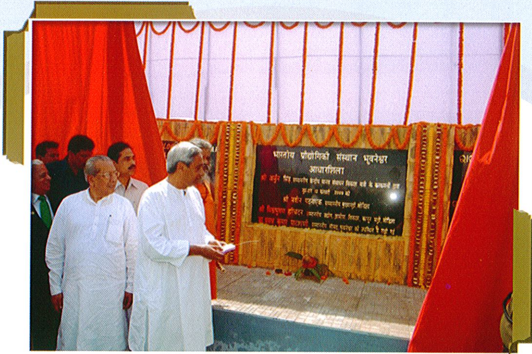
रिमोट कंट्रोल के जरिए आधारशिला का अनावरण करते हुए श्री नवीन पटनायक, माननीय मुख्यमंत्री, उड़ीसा। Shri Naveen Pattnaik, Hon. CM, Orissa unveiling the foundation stone through a remote control.