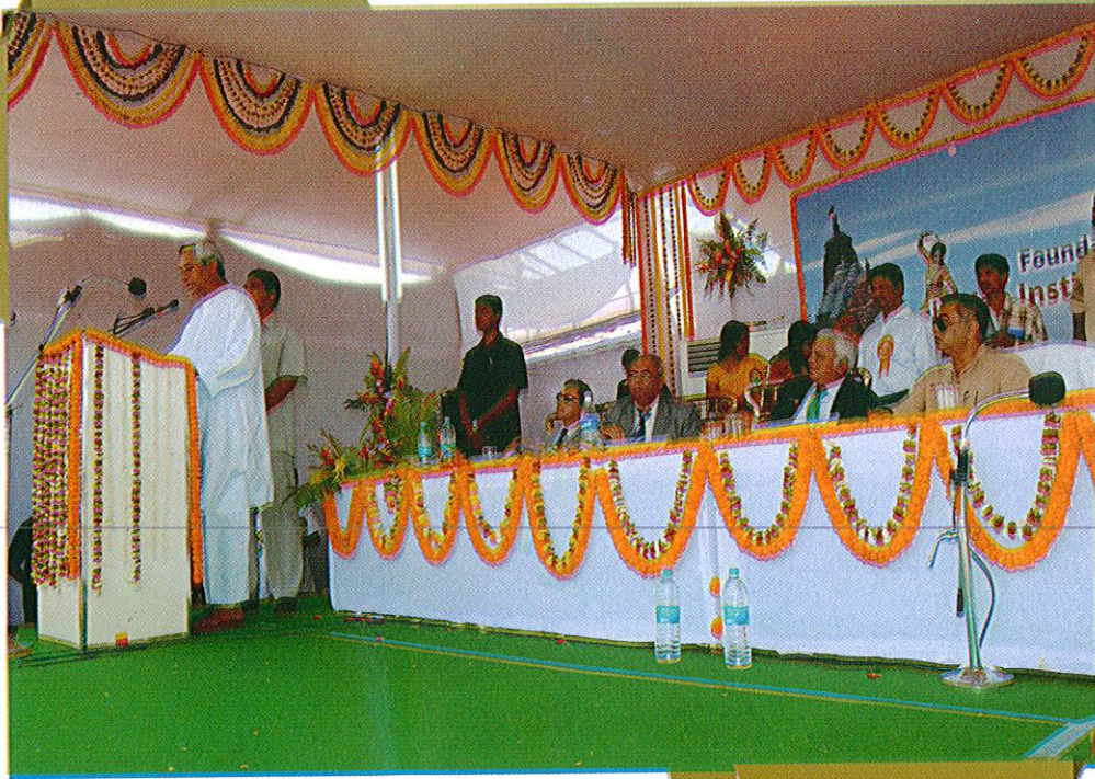
आधारशिला रखने के पश्चात् समारोह को सम्बोधित करते हुए श्री नीवन पटनायक, माननीय मुख्यमंत्री, उड़ीसा। Hon'ble CM, Orissa Shri Naveen Pattanaik, addressing the function after laying the foundation stone.