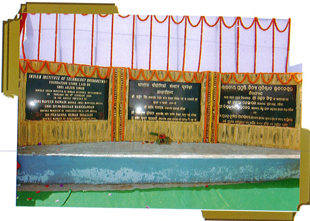
भारतीय प्रौद्योगिकी संस्थान, भुवनेश्वर के स्थायी स्थल पर अंग्रेजी, हिन्दी तथा उड़िया में आधारशिला पर उकेरे गए शब्दों के फोटोग्राफ।