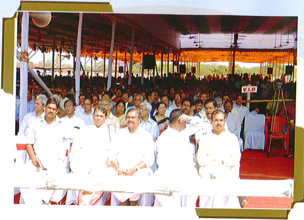
आधारशिला समारोह में उपस्थित अतिविशिष्ट व्यक्तिगण। VIPs attending the foundation laying ceremony.